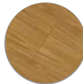
4 Side Micro Bevel